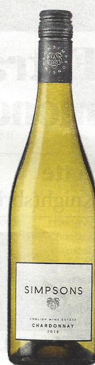
2018 SIMPSONS ESTATE CHARDONNAY WAITROSE, £14 Kent New to the Waitrose range and launched last week, this is a 100% chardonnay from vines cultivated on the chalky North Downs of Kent. Clean and well textured, with subtle hints of pear and citrus, it finishes with a zesty saline tang.