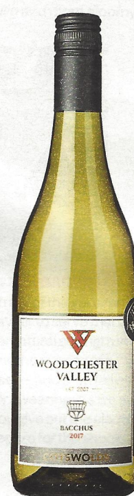
2017 WOODCHESTER VALLEY BACCHUS FORTNUM & MASON, £15 Cotswolds One of the most interesting English bacchus examples I've tasted. Produced in the Cotswolds, it has all you could wish for in this grape variety: gooseberry, elderflower and citrus aromas, with a bone-dry finish.