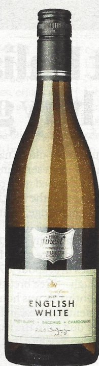
2018 TESCO FINEST ENGLISH WHITE TESCO, £12 Kent This blend of pinot blanc, bacchus and chardonnay is produced by the Hush Heath estate. It has benefited from favourable growing conditions in 2018 and has traces of elderflower, peach and citrus, finishing dry and crisp.