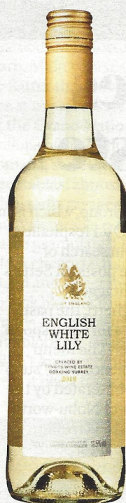
2018 DENBIES ENGLISH WHITE LILY MARKS & SPENCER, £10 Surrey Produced by the Denbies estate near Dorking, this crowded blend contains Ortega, müller-thurgau, seyval blanc and bacchus. Lime and white fruit combine to yield a tangy bite on the finish.